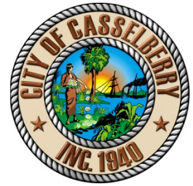
Exhibit Title: _____